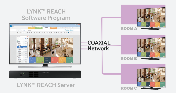
Figure 1. LYNK REACH solution diagram

LYNK<sup>™</sup> REACH is designed exclusively to help hospitality businesses remotely, centrally and cost efficiently manage in-room displays. LYNK REACH is an server and software solution for hospitality environments that provides a simplified UI and editing tool. The software solution organizes and displays content, such as hotel information, images and logos and rich content including flight information, weather information and advertisement, using existing coaxial infrastructure. In addition, LYNK REACH improves usability by enabling hotel managers to edit channels and to monitor room status, recent deployment and activity. The solution also provides a simple, easy and intuitive user interface (UI) through Content Creator.