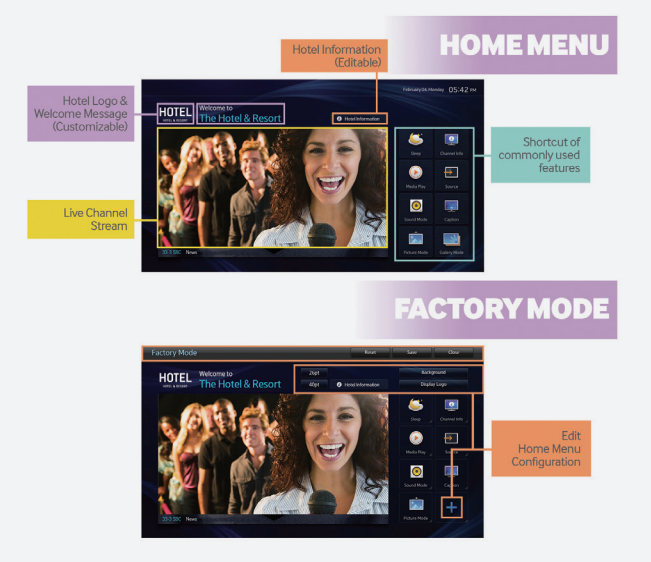
Figure 2. Enhanced Home Menu enables convenient delivery of useful information, while supporting hotel branding

The customizable Home Menu reduces the cost burden for hotels with consumer TVs that would otherwise have to adopt solution-embedded Hospitality TVs. With the Home Menu, these hotels can move forward from conventional consumer TVs to solution-based Hospitality TVs without incurring a huge expense.